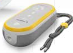
Swing Maxi™ Hands-free

DOUBLE PUMPING for more milk in less time!